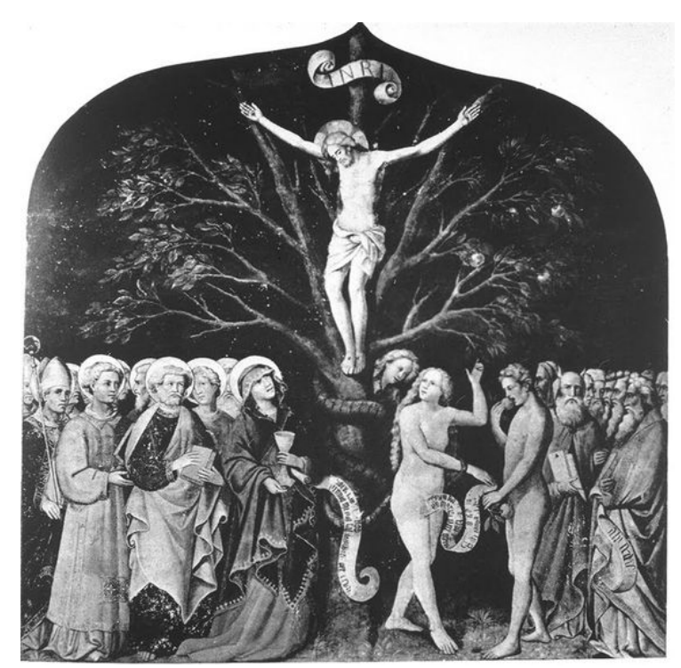
Figure 1"Mystery of the Fall and Redemption of Man" by Giovanni da Modena (1420)

On the tree is the Good in flesh; Jesus said, "God alone is Good." Jesus is the Good in flesh. And on the tree is the Life; Jesus said, "I am the life."